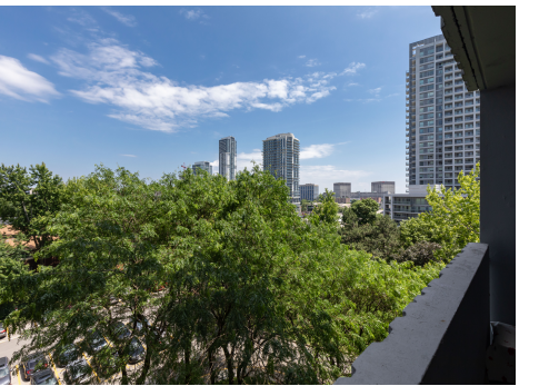
Check out the Youtube video at www.LovelyTorontoCondos.com