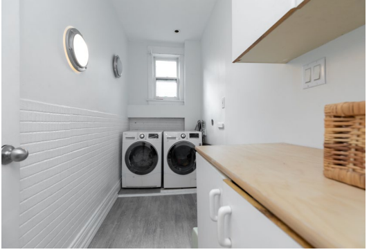
Check out the Youtube video at www.LovelyTorontoHomes.com!