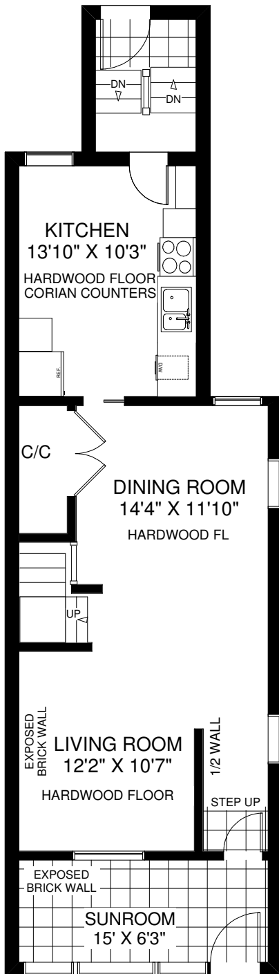
MAIN FLOOR APPROXIMATELY 839 SQ FT

THE JULIE KINNEAR TEAM Royal LePage Real Estate Services Ltd., Brokerage (416) 762-8255